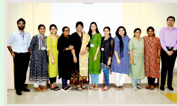
Trainees from course conducted in September, 2022