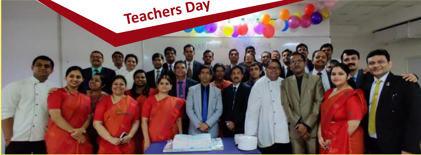
Students of WGSHA, Celebrated 'Teachers Day 2019' by conducting different activities for the for the faculty with a Cake Cutting.